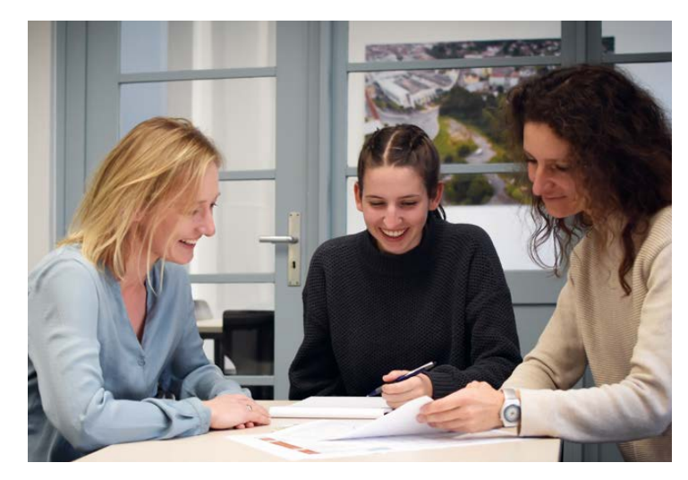
We offer a future-oriented master's programme with an individual support of our students from the very first request for advice to the nurturing of relationships within the framework of an alumni network.