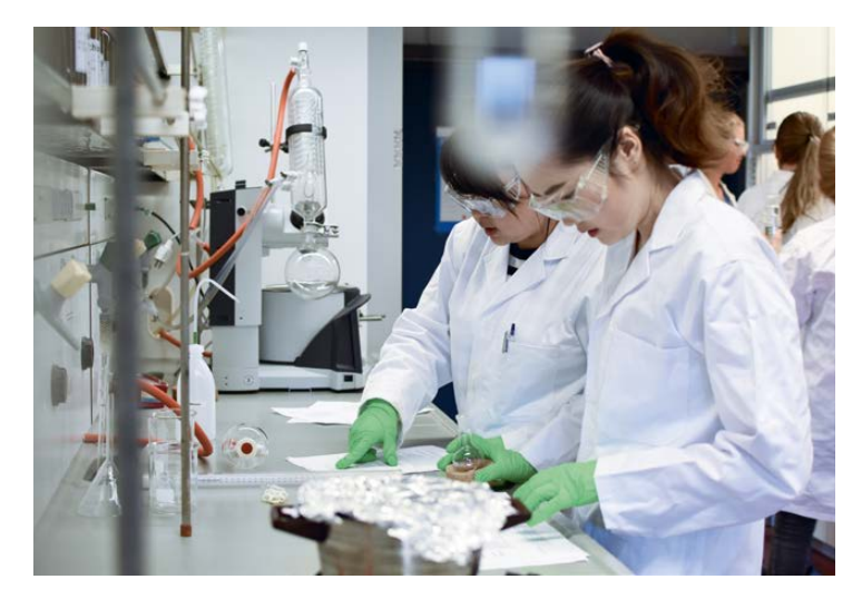
Food quality and safety are directly related to human health. Ensuring the integrity and supply of nutritious food is critical for public health.