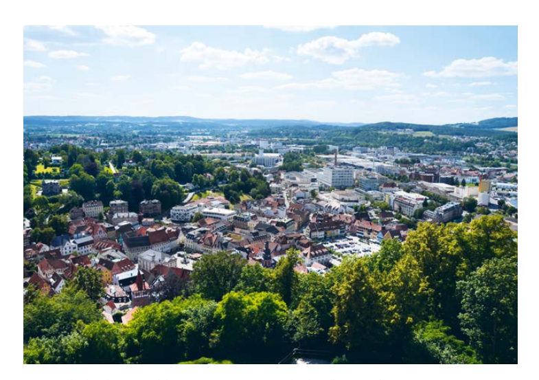
Kulmbach is an old margravate town which is home of companies, authorities, and research institutes in the food sector. With around 26,000 inhabitants, the town offers a full range of cultural and gastronomic delights.